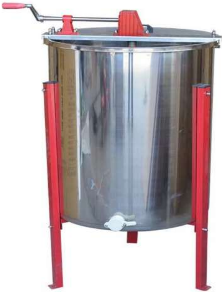
Picture for honey extractor