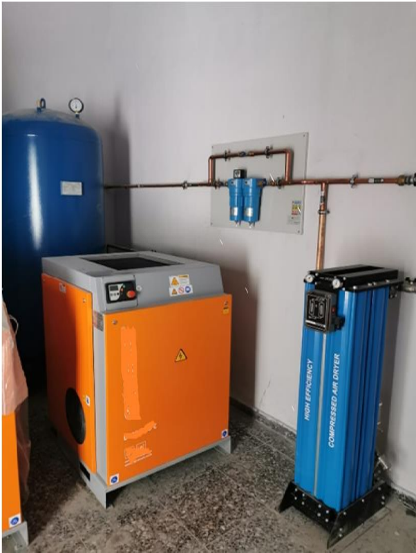
MEDICAL AIR PLANT & AIR TANK