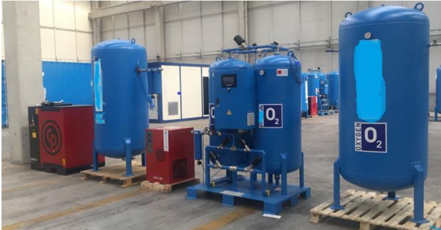
MEDICAL OXYGEN PRODUCTION PLANT