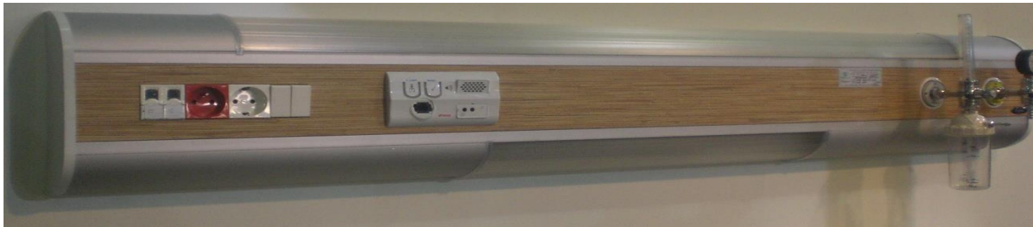
BED HEAD UNIT FOR 1 BED IN ROOMS, 100 - 120 CM LENGTH