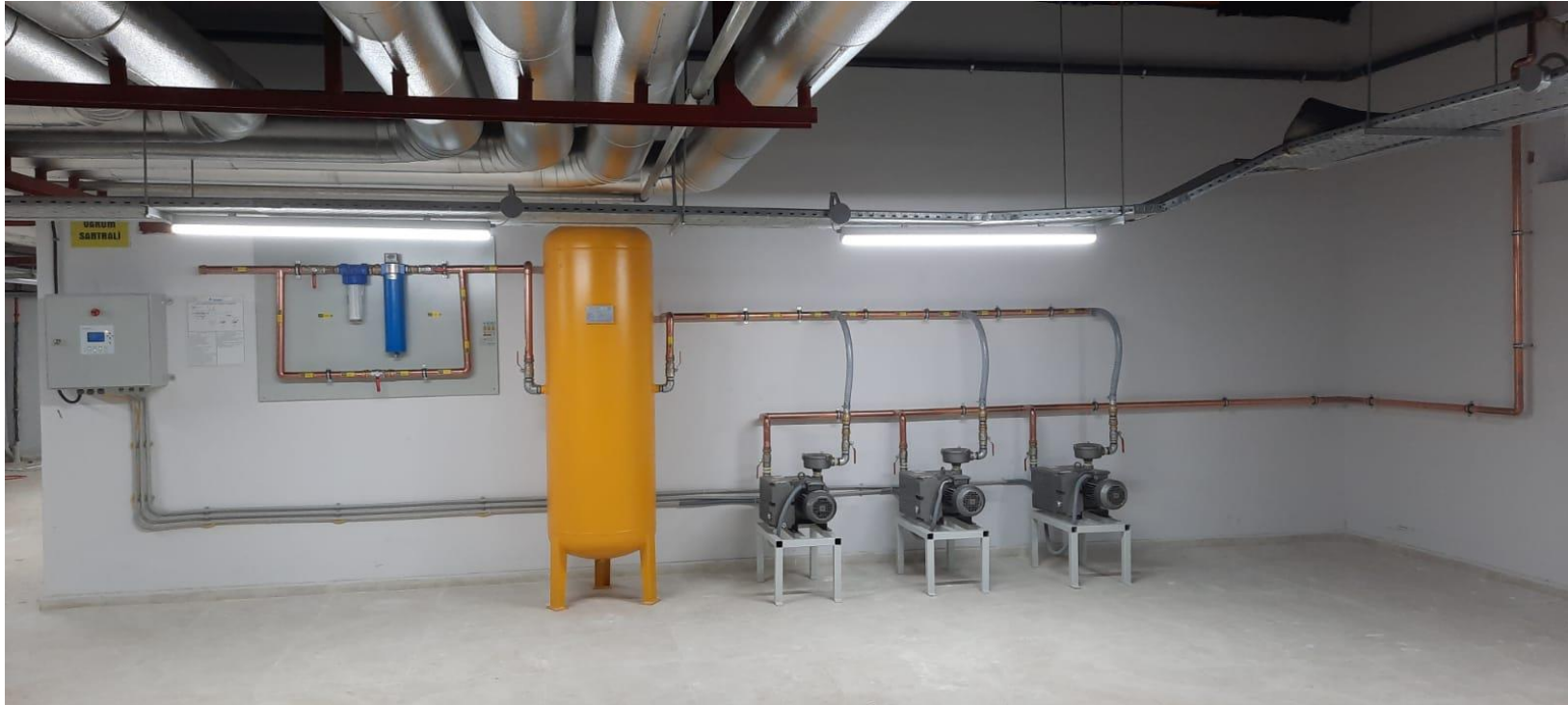
MEDICAL VACUUM PLANT