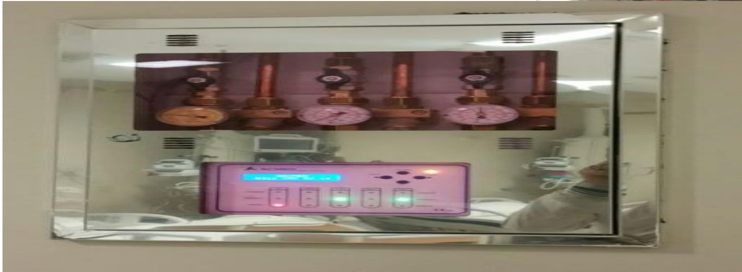
AVSU Panel, 2, 3 & 4 Gases - Stainless Steel