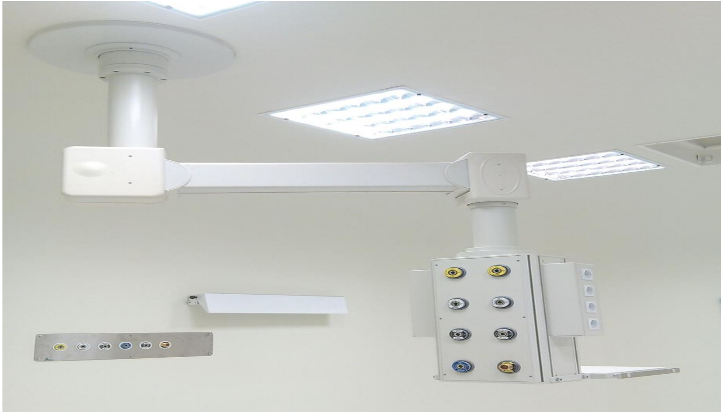
CEILING PENDANT FOR DELIVERY & OPERATION ROOMS