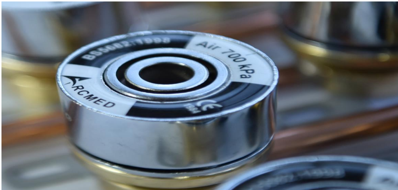
Oxygen Outlet - BS Norm & Medical Air 4 Bar Outlet - BS Norm