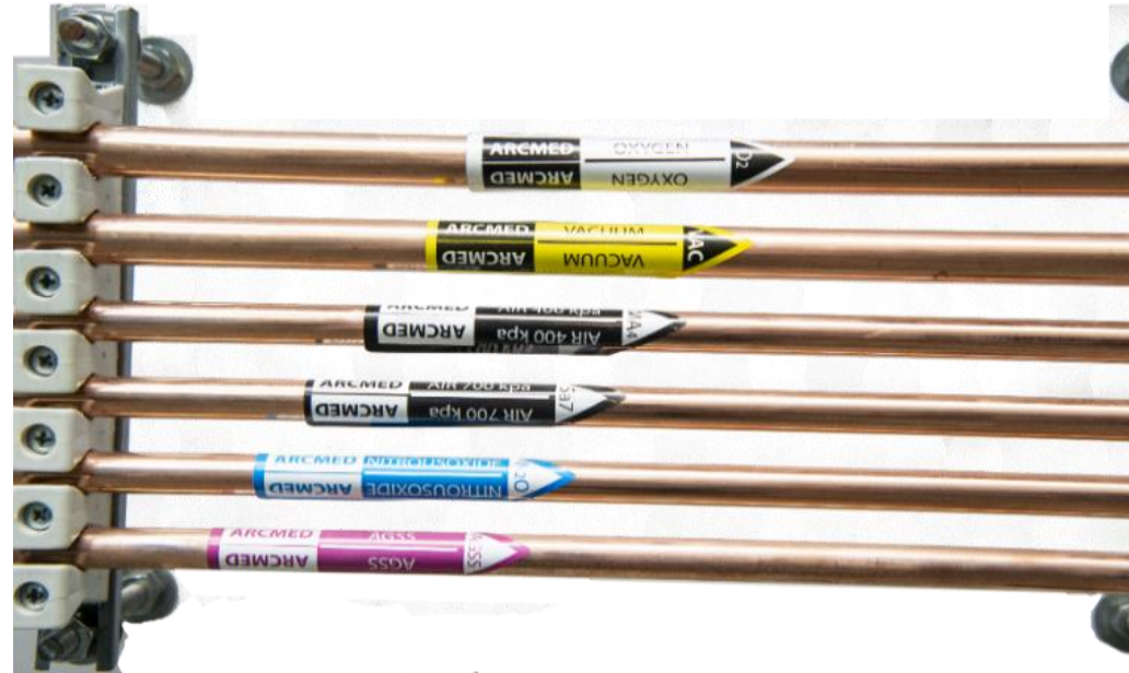
Medical Copper Pipes different sizes