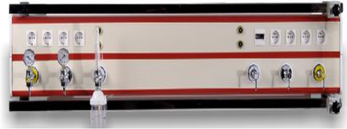
CEILING PENDANT FOR DELIVERY & OPERATION ROOMS