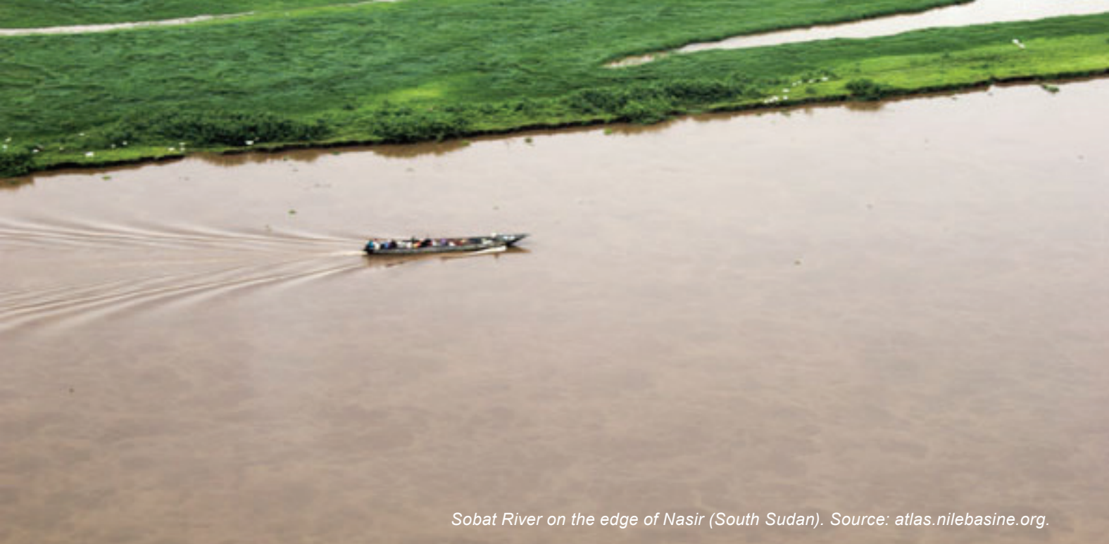
Sobat River on the edge of Nasir (South Sudan).