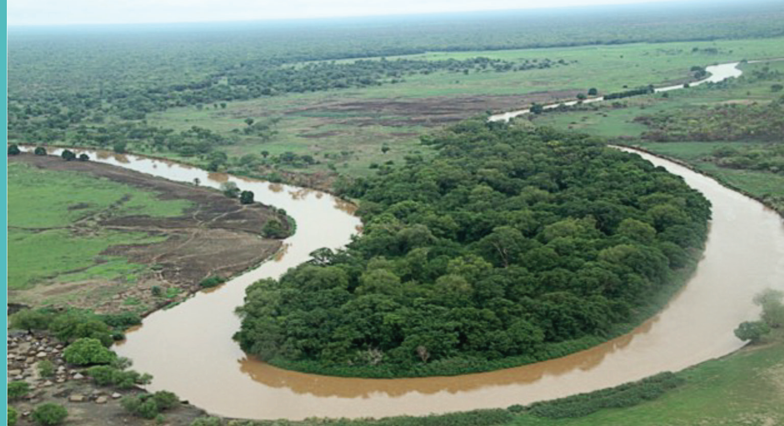
Figure 2: Gillo River in Nuer Zone (Gambella region), one of the tributaries of BASRB

and production than the rivers themselves. Wetlands are typically important for fish breeding, nursing and feeding grounds; and are also known, especially in South Sudan, as an area where women are most likely directly involved in fishing since the fisheries there are to an extent based on foot and use of basket and other local traps. According to Robelo and McCartney (2012), these wetlands though not fully exploited are under increasing threat and require better and integrated planning and management to continue delivering the vital ecosystem services.