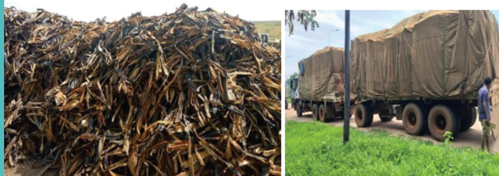
Figure 5: Mixed catch of sundried packed by traders and transported for export to Sudan from Baro-Akobo of Gambella region (Ethiopia).

and conditions with powerful players; agree and enforce sustainable fisheries resource management; and fight for the labour rights of women wage workers. There should be deliberate efforts to include women and youths in the fisheries management committees and/or fisheries co-management units.