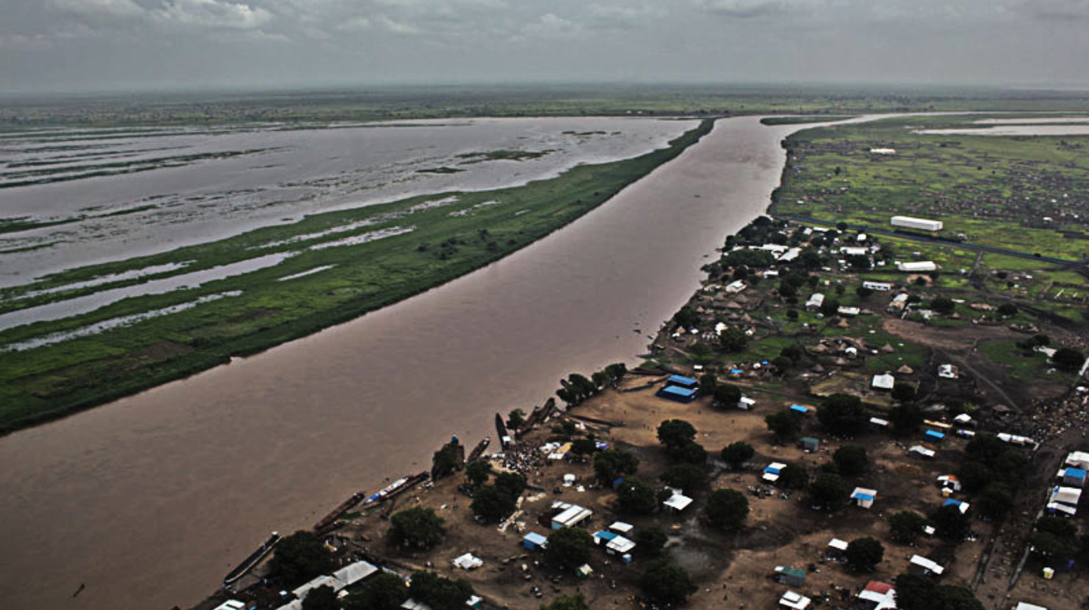
Figure 3. Sobat River on the edge of Nasir (South Sudan).