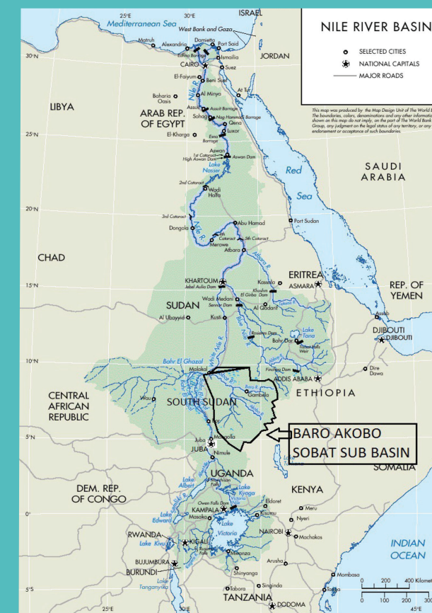
Figure 1: Map of the Baro-Akobo-Sobat Basin